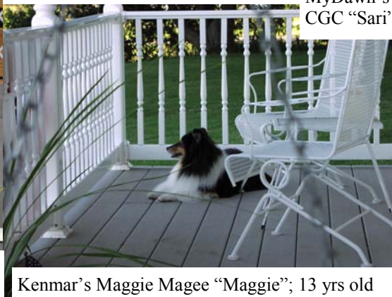
Kenmar's Maggie Magee "Maggie"; 13 yrs old