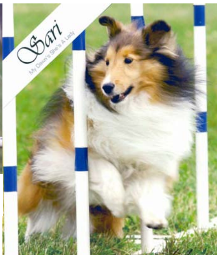
MyDawn's She's A Lady CD AX AXJ CGC "Sari"; 8 yrs old