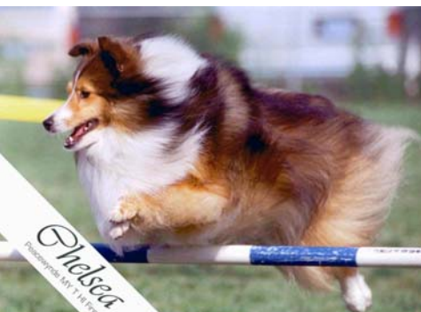
My T Hi Peacewynde Fire Opal CD NA NAJ CGC "Chelsea"; 13 yrs old