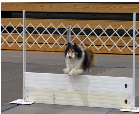
Kandisweet MyDawn's Lady C CD AX AXJ CGC "Charlotte"; 11 yrs old